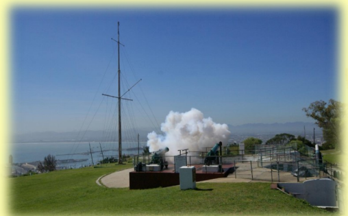
firing of the noon day gun on Signal Hill

The idea of a 'Two Minute Silence' originated in South Africa. The practice of the Remembrance Day silence originates in Cape Town, where there was a two-minute silence initiated by the daily firing of the noon day gun on Signal Hill for a full year from 14 May 1918 to 14 May 1919, known as the Two Minute Silent Pause of Remembrance.