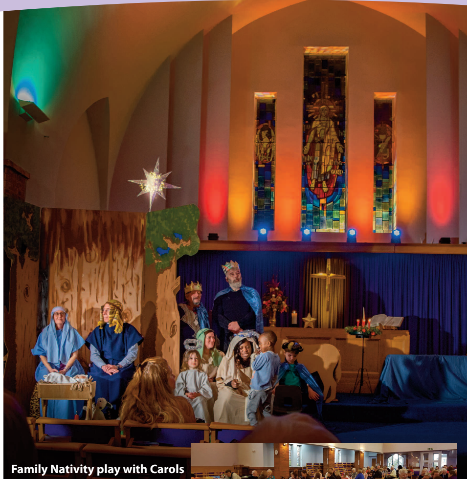
Family Nativity play with Carols