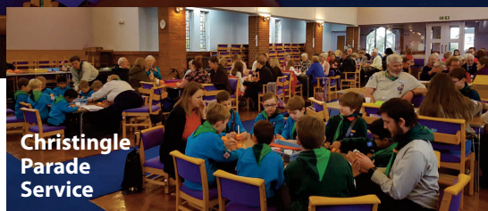
Christingle Parade Service